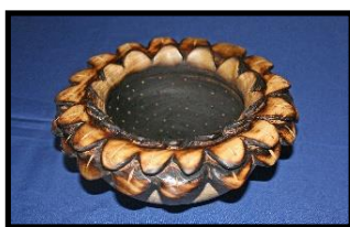
Tic Challis — 2nd Place