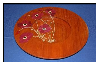
Ian Cameron—3rd Place